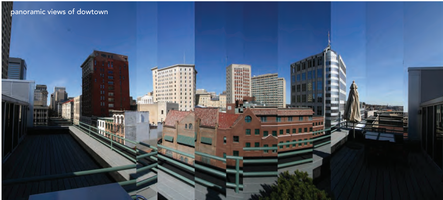
panoramic views of downtown